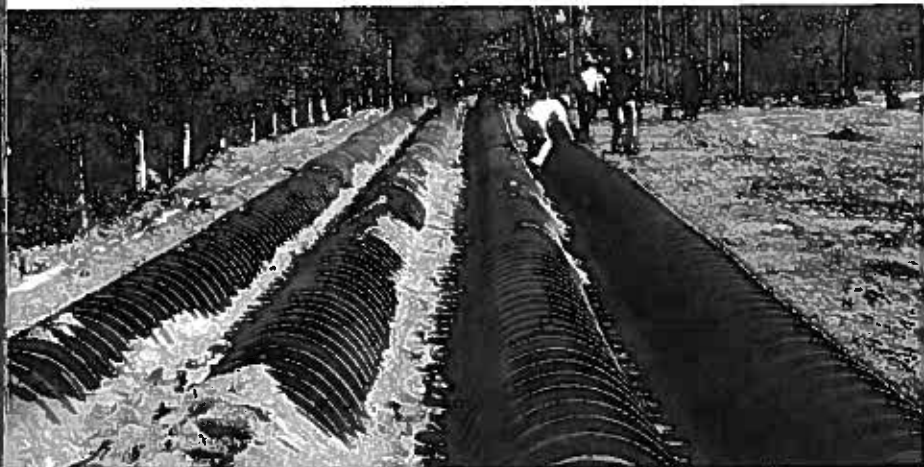
■ 500 Quick4 infiltration chambers were installed in clean sand for new Acapulco auditorium.

The new 3,500-seat, 52,000-square foot Carretera Nacional in Acapulco features innovative wastewater treatment with SBR, infiltration system from Infiltrator Systems Inc. and septic tank