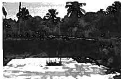
■ A 19,020-gallon capacity septic tank is included in installation