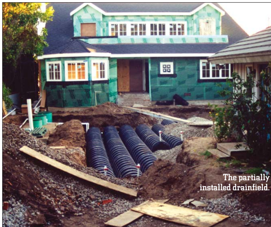
The partially installed drainfield.

The FAST unit requires quarterly maintenance to ensure that the blowers are working and all parts are functioning properly. “We check the dosing piping to make sure it isn’t clogged,” says Mosser, “because back then systems weren’t installed with back-flush capabilities. They are now.” The system is functioning flawlessly. ■