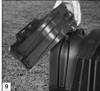
Attach end cap to last chamber.

9. The last chamber in the trench requires an end cap. Lift the end cap at a 45-degree angle and align the connector hook on the top of the chamber with the raised slot on the top of the end cap. Lower the end cap to the ground and into place.