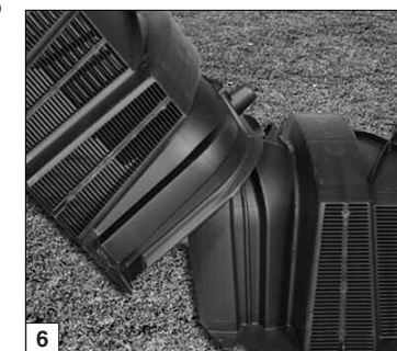
6 Connect chambers.

Note: The connector hook serves as a guide to ensure proper connection and does not add structural integrity to the chamber joint. Broken hooks will not affect the structure or void the warranty.