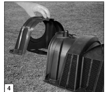
4 Place end cap onto first chamber.

Optional: Fasten the end cap to the chamber with a screw at the top of the end cap.