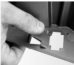
6. Activate StraightLock tabs.

6. Where the system design requires straight runs, use the StraightLock™ Tabs to ensure straight connections. To activate the tabs, pop the tabs up with your thumb and lock into place.