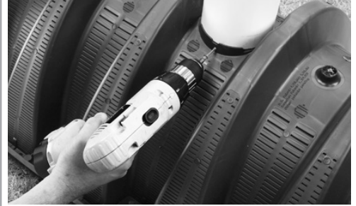
3. Fasten the pipe.

3. Use two screws to fasten the pipe to the sleeve around the inspection port.