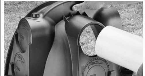
5. Insert inlet pipe.