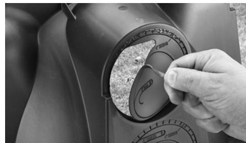
2. Pull tab tear-out seal.