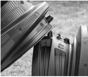
4. Connect the chambers.

4. Lift and place the end of the next chamber onto the previous chamber by holding it at a 90-degree angle. Line up the chamber end between the connector hook and locking pin at the top of the first chamber. Lower it to the ground to connect the chambers.