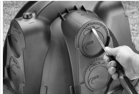
1. Start tear-out seal.