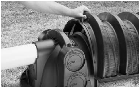
3. Place first chamber onto endcap.

3. Place inlet end of first chamber over back edge of endcap.