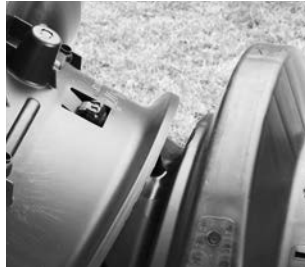
8. Attach endcap to chamber.

8. The last chamber in the trench requires an endcap. Lift the endcap at a 45-degree angle and insert the connector hook through the opening on the top of the endcap. Applying firm pressure, lower the endcap to the ground to snap it into place. Do not remove the tear-out seal.