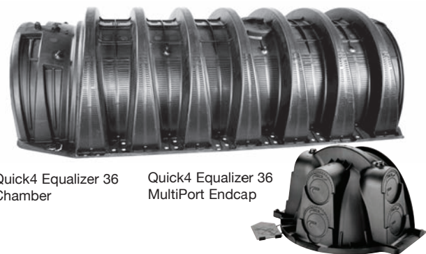
Quick4 Equalizer 36 Chamber Quick4 Equalizer 36 MultiPort Endcap